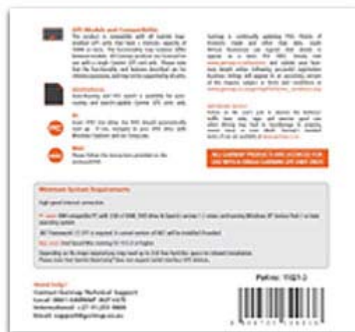
Africa Series 2011 3 rd Edition Mapset DVD Cover