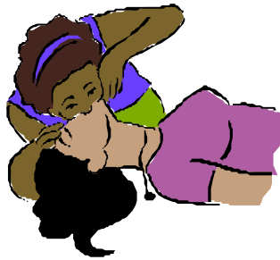
Pinch nose closed and administer 2 full breaths (Less air for small children and infants)