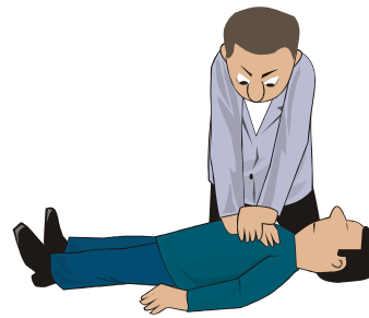
30 Compressions Rate: 100 / minute (Adult 2 hands, child 1 hand, infant 2 fingers)

Repeat cycle of 2 breaths and 30 compressions until breathing resumes or help takes over.