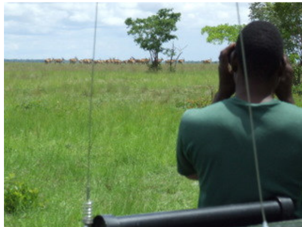
Monitoring the new herd of Eland.