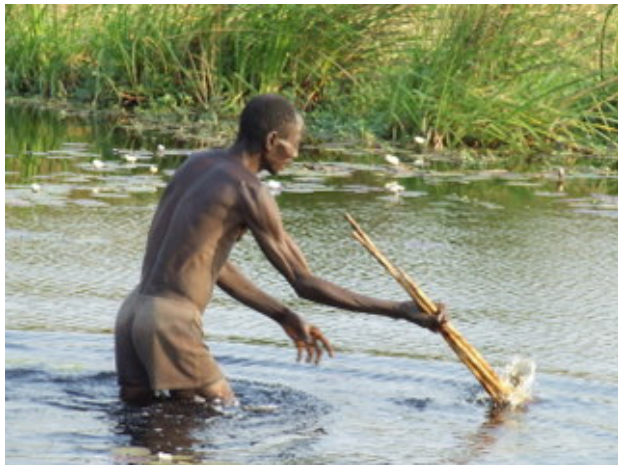
Lozi spear fisherman.